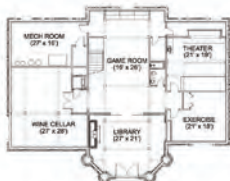
LOWER | level