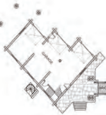
MAIN | level

Special Features: Edgewood's proprietary engineered architectural Glass Forest®. Custom crafted structural timber trusses with antique metal tension rods and brackets, and two massive custom log stair systems in the foyer.