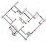
UPPER | level