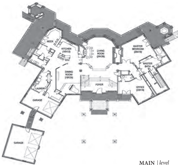
MAIN | level